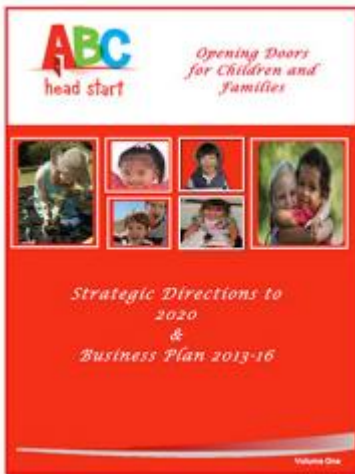
Strategic Directions to 2020